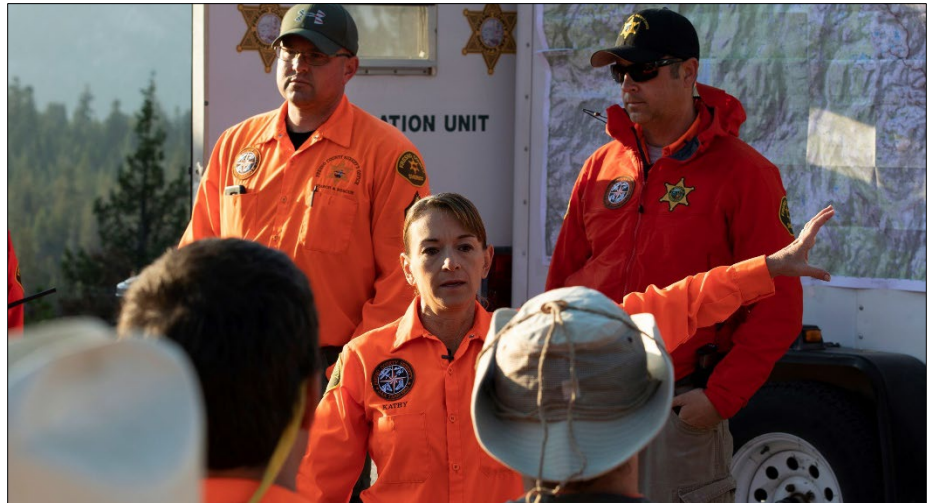
Leadership can take a toll. And while public safety is stressful, leadership in public safety can be exponentially more so.

We see you desiring to serve your communities and families and career. We see you exhausted. We see you